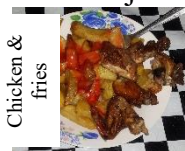
Chicken & fries