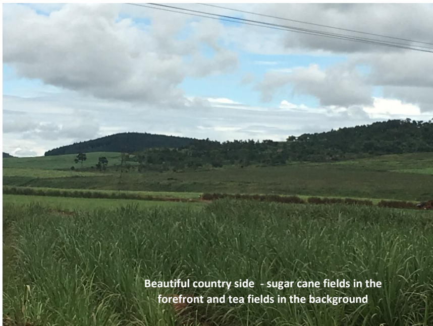
Beautiful country side - sugar cane fields in the foreground and tea fields in the background