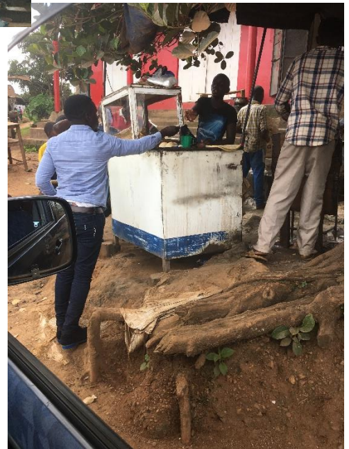
Road side food stand – buy a chapat (thick flatbread) with eggs (with just a little dirt & other unknown things) for less than 50 cents. It'll hold ya 'til dinnertime!