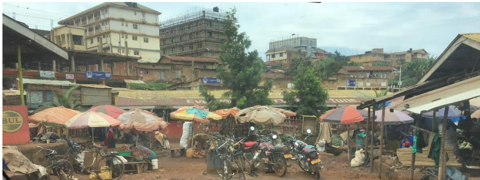
Marketplace in Mukono