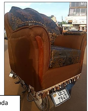
Chair on bodaboda