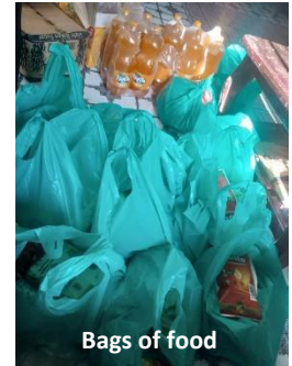
Bags of food

Paul & Leticia Evans (Say Yes liaison) were very busy purchasing the food in bulk and re-packaging it in appropriate portions. Each family received a minimum of rice, sugar, spaghetti, maize flour, soap, 2 kgs of meat, cooking oil, soda and salt. The meat was a big deal as most cannot often afford to purchase it.